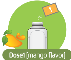
Dose1 [mango flavor]